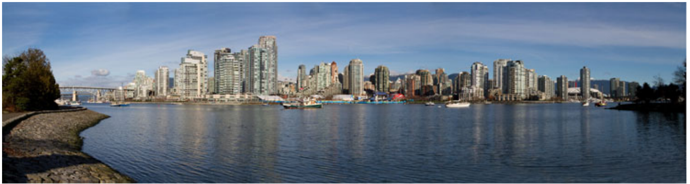
False Creek - Vancouver, B.C., Canada.